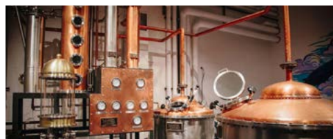
New Holland Distillery