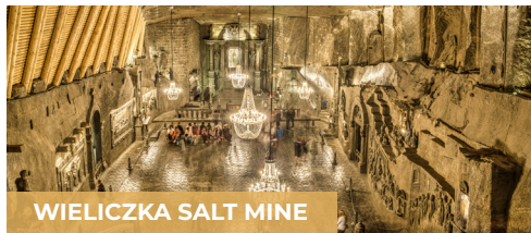
WIELICZKA SALT MINE