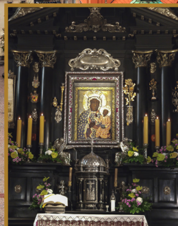
BLACK MADONNA Czestochowa