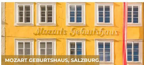
MOZART GEBURTSHAUS, SALZBURG