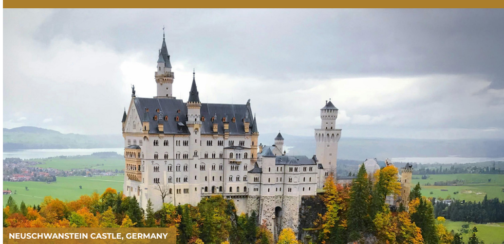
NEUSCHWANSTEIN CASTLE, GERMANY