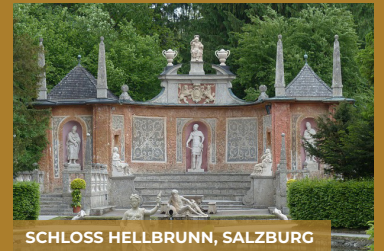
SCHLOSS HELLBRUNN, SALZBURG