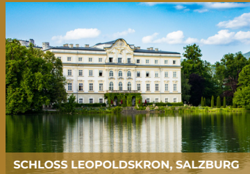
SCHLOSS LEOPOLDSKRON, SALZBURG