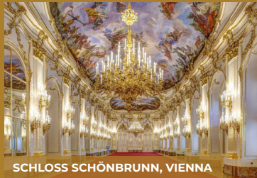
SCHLOSS SCHÖNBRUNN, VIENNA