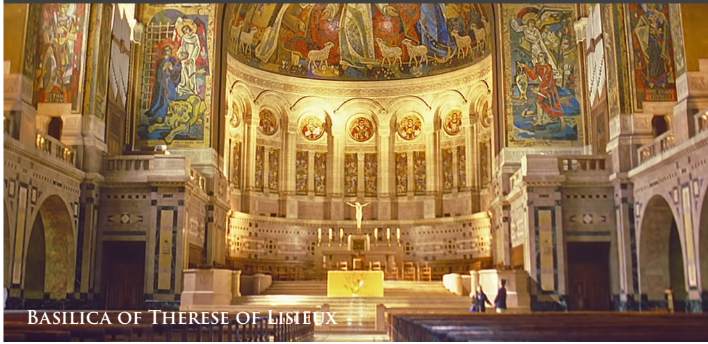
BASILICA OF THERESSE OF LISIEUX