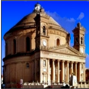
St. Mary's Church, Malta