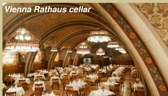
Vienna Rathaus cellar