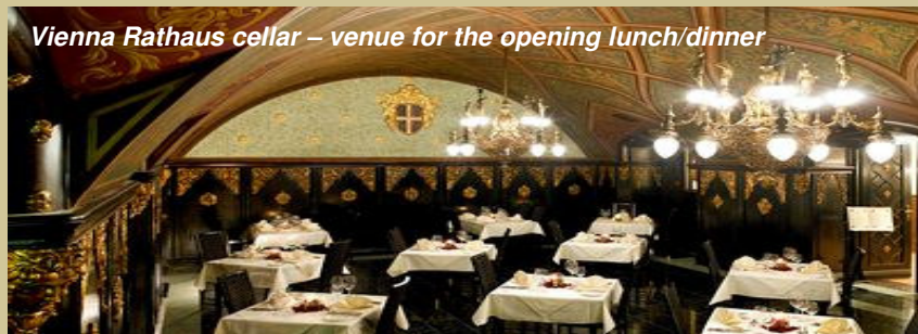
Vienna Rathaus cellar – venue for the opening lunch/dinner