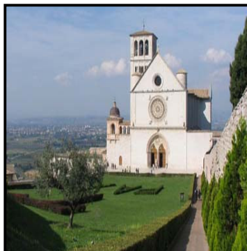
St. Francis of Assisi