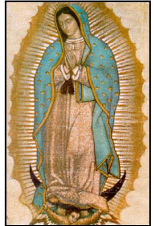
Our Lady of Guadalupe