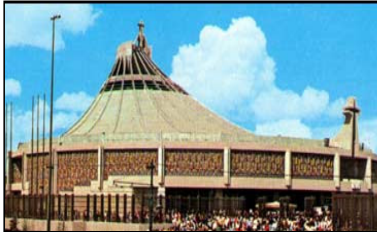
Basilica of Our Lady of Guadalupe