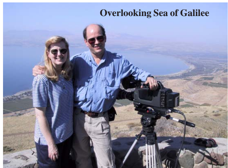
Overlooking Sea of Galilee

We personally invite you to join us on this trip of a lifetime!