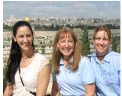
Overlooking the Old City of Jerusalem from Mt. of Olives