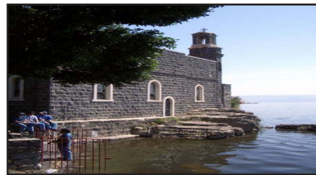
Primacy of St. Peter's Church