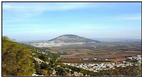
Mount of Transfiguration