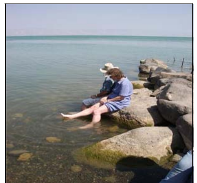
Meditating on the Sea of Galilee

"You put your heart into your work and it shows. My memories are recalled everyday as I refer to your handbook when I do my daily scripture readings and say a decade of the rosary. Walking in the footsteps of Jesus and Mary has brought my prayers to life. Thanks again for the most important journey of my life"