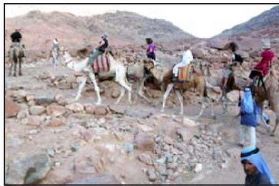
Camel Ride up Mount Sinai