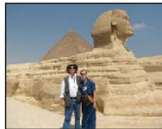
Sphinx in Giza Egypt

Wednesday, November 11 Egypt Extension in Cairo, Egypt Travel to Giza to visit the Pyramids , one of the Seven Ancient Wonders of the World, and the Sphinx . Then to the Egypt Museum to see biblical history and the treasures of King Tut.