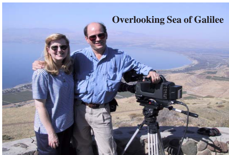
Overlooking Sea of Galilee

We personally invite you to join us on this trip of a lifetime!