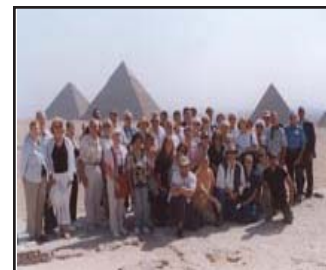
Pyramids of Egypt

Monday, November 23, 2009 Return home after a memorable trip to the Holy Land.