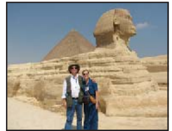
Sphinx in Giza Egypt

Wednesday, November 11 Egypt Extension in Cairo, Egypt Travel to Giza to visit the Pyramids , one of the Seven Ancient Wonders of the World, and the Sphinx . Then to the Egypt Museum to see biblical history and the treasures of King Tut.