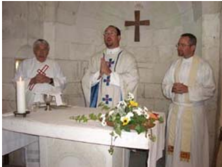
Private Daily Mass at the holiest sites in the world