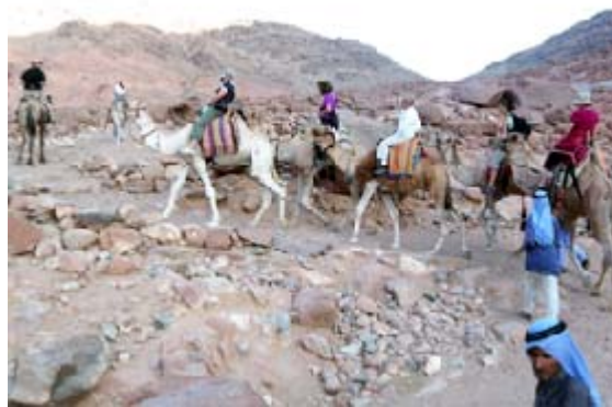
Camel Ride up Mount Sinai