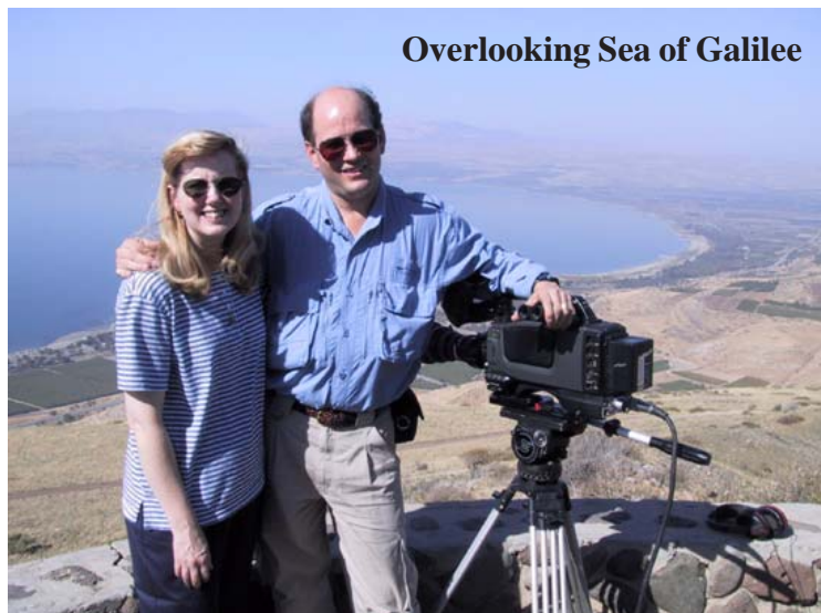
Overlooking Sea of Galilee

We personally invite you to join us on this trip of a lifetime!