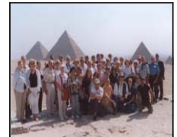
Pyramids of Egypt

Monday, Nomember 23, 2009 Return home after a memorable trip to the Holy Land.