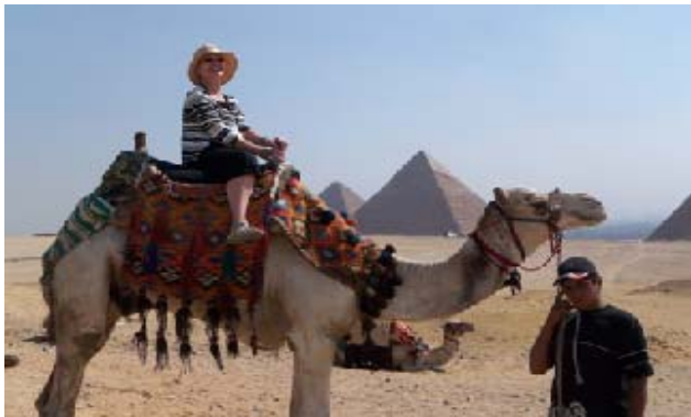
Camel Rides in Egypt