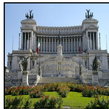
Vittorio Emmanuel Monument